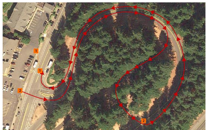
Route through Light Display