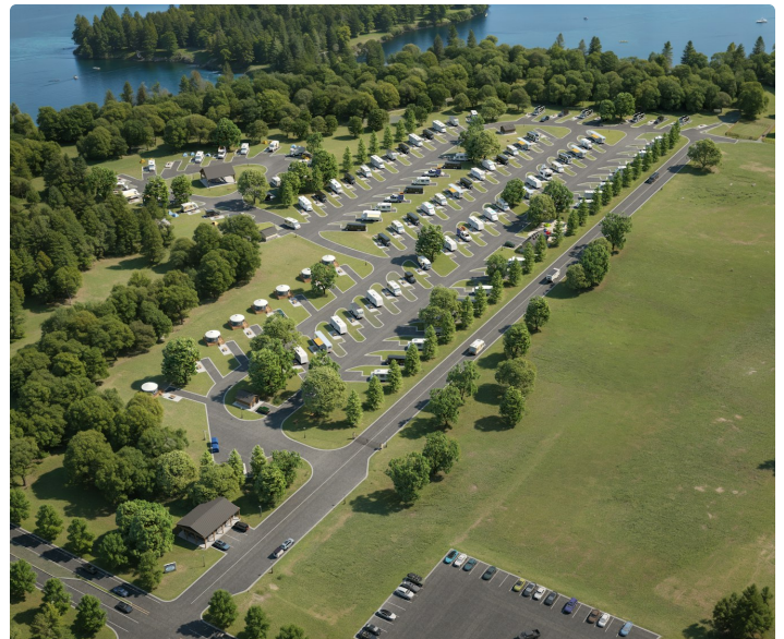
Rendering: Proposed Herman Creek Cove campground & recreation development