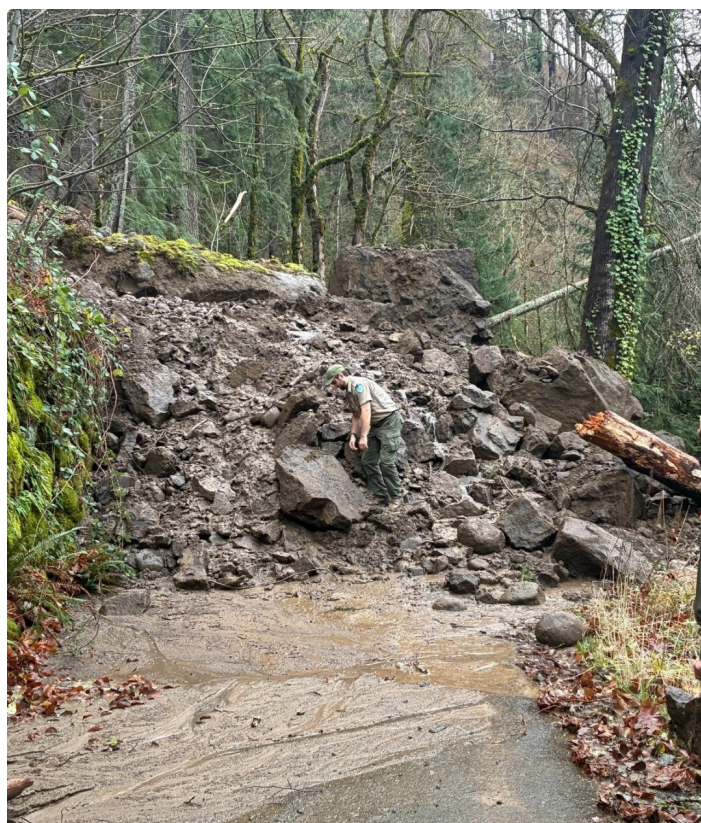
Ruckel Creek landslide blocking the Historic Columbia River Highway Trail, Dec. 2025