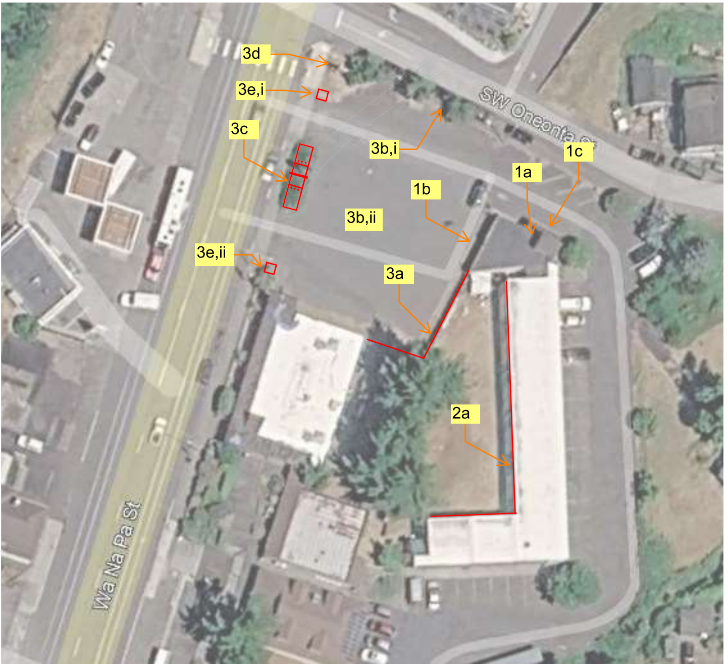
Site scope of work Refer to scope narrative