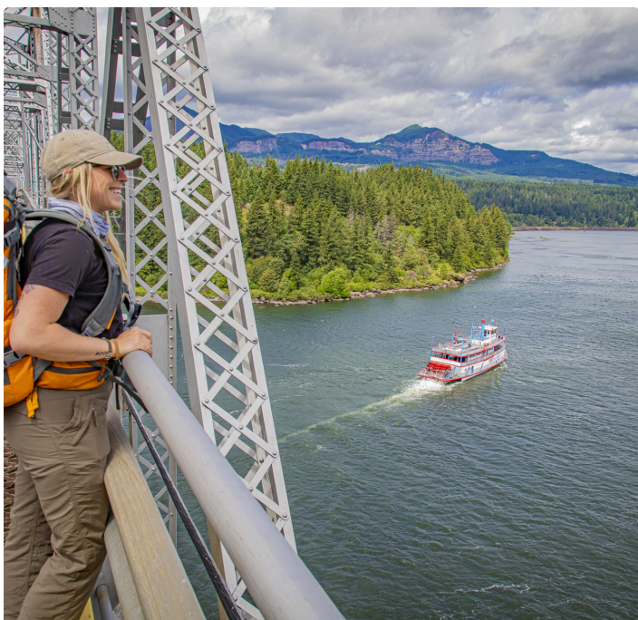
See front page for aerial view — Bridge of the Gods, Cascade Locks, Oregon