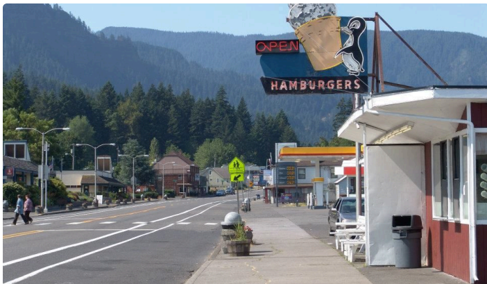
Downtown Cascade Locks — the community the Port serves