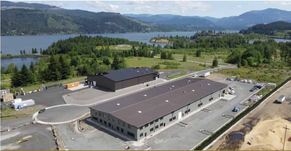
Aerial view looking over Flex 5 and 6 with view of Columbia River.

PRSR STD ECRWSS U.S. POSTAGE PAID EDMM RETAIL